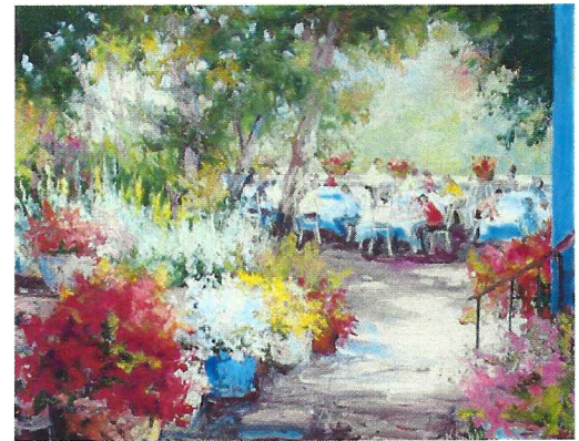
Dinning in Tuscany Oil 24x30