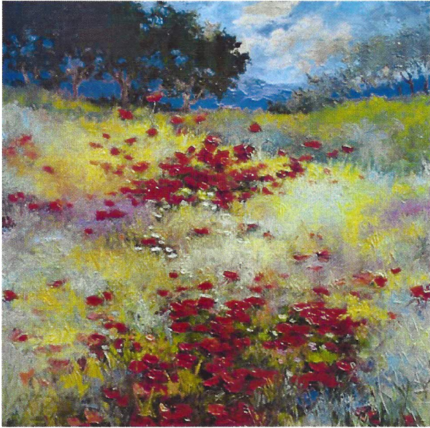
Poppies and Olive Groves Oil 48x48