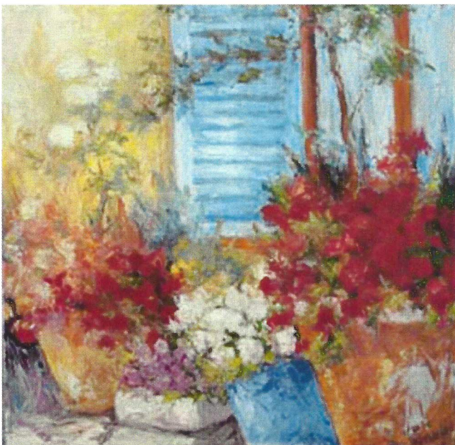
Tuscan Flower Pots Oil 30x30