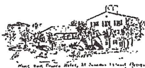
Marion Van Patten Hotel, St. Simons Island, Georgia