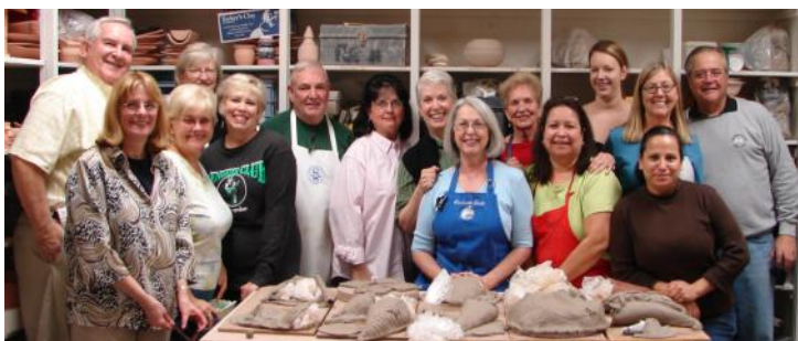
"MUD! & Merlot, OGIAG Class of 2011" Oak Grove group really enjoyed their evening slinging MUD at Glynn Art.